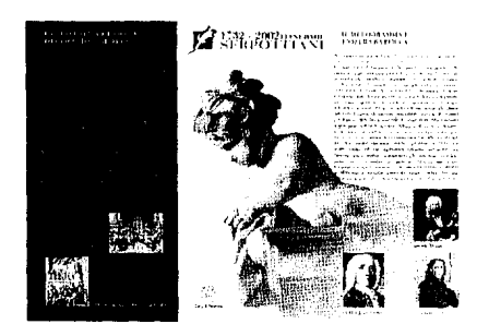
Figure 4: A folder

the Town Council and Diocese involved but, as often happens here in Southern Italy, while showing interest, they only offered moral support. Steaming ahead regardless, the project will promote a celebratory year dedicated to "Serpotta in Palermo" in 2001, the 270<sup>th</sup> anniversary of the artist.