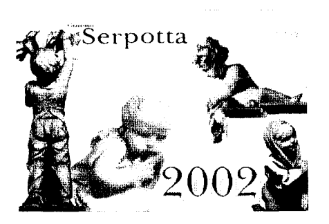
Figure 2: Cover of a calendar

3) give incentives to the development of social and economic activities deriving from tourism and related industries and to the increase the production of locally-produced saleable items, usually arts and crafts and this includes paying close attention to the quality of packaging and other selling aspects of the high quality traditional food and wine products from the area.