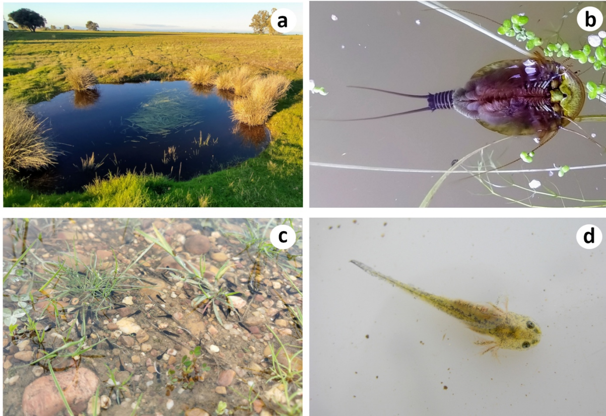
Figure 2. Pictures showing the temporary pond studied, as seen in February 2023 (a) and examples of its fauna, including the tadpole shrimp Triops gadensis , newly recorded in Córdoba province (b), and larval stages of two protected amphibian species: the natterjack toad ( Epidalea calamita ) (c), and the Iberian ribbed newt ( Pleurodeles waltl ) (d).

Despite its recent, man-made origin, the pond studied has developed a biocoenosis typical of mature temporary ponds (Fig. 2): aquatic macrophytes and helophytes include Glyceria declinata Brébisson, 1859, Callitriche lusitanica Schotsman, 1961, Damasonium alisma Miller, 1768, Damasonium bourgaei Coss, 1849 and Scirpoides holoschoenus (Linné) Soják, 1972. It is inhabited by three protected species of Amphibia, Pleurodeles waltl Michahelles, 1830, Epidalea calamita (Laurenti, 1768) and Pelodytes ibericus Sánchez-Herráiz, Barbadillo, Machordom & Sanchiz, 2000. The crustacean fauna includes the large branchiopods Triops gadensis and Chirocephalus diaphanus Prévost, 1803, and the copepod Mixodiaptomus incrassatus (Sars, 1903). Unfortunately, no other data about the co-occurring crustacean fauna are to date available.