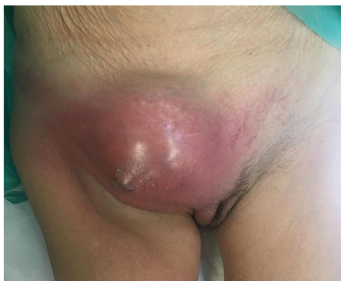
Fig. 1 De Garengeot's hernia

The CT scan of the abdomen (Fig. 2) revealed the herniation of the appendix in the femoral hernia sac. The patient received intravenous fluids and antibiotics (500 mg of metronidazole and 1 g of cefazolin); the surgical operation was proposed.