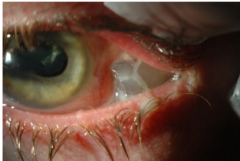
Figure 3. A left aphakic eye with an extrusion of a MIRAgel (hydrogel) buckle through the temporal conjunctiva.

age and hematologic factors such as sickle cell disease and the presence of atheromatosis. Cryotherapy or buckle compression can cause an injury to the posterior ciliary arteries, leading to non-perfusion of the anterior segment [69]. Disinsertion or manipulation of recti muscles could also affect anterior segment perfusion [69]. Indications for buckle removal include anterior segment ischemia and iris neovascularization [69]. Abnormal retinal blood flow has been shown after scleral buckling with an encircling band [65,66]. Anterior segment ischemia has been found even in cases where a segmental buckle was used [67]. A posterior segment ischemia has been demonstrated following scleral buckling, but ophthalmic artery blood flow seems to be not significantly affected after the procedure [68].