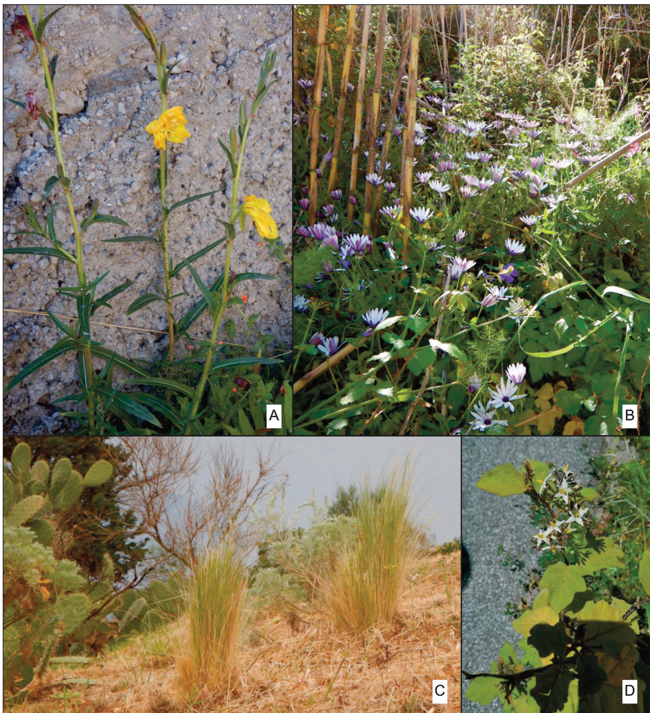
Figure 2. A Oenothera odorata from site 1 B Dimorphotheca ecklonis from site 1 C Nassella tenuissima from site 3 D Solanum torvum from site 4. For details on the sample sites, see Table 1.

A total of 48 alien taxa were recorded (12.4%), 20 of which are casual, 26 naturalized and two invasive (i.e. Ailanthus altissima (Mill.) Swingle and Oxalis pes-caprae L.). Noteworthy is the discovery of Oenothera odorata Jacq. (Onagraceae) (Fig. 2A), a naturalized species new to Italy, as well as, Dimorphotheca ecklonis DC. (Asteraceae) (Fig. 2B), Nassella tenuissima (Trin.) Barkworth (Poaceae) (Fig. 2C), Solanum torvum Sw. (Solanaceae) (Fig. 2D), and Viola wittrockiana Gams ex Nauenb. & Buttler (Violaceae) new to Sicilia.