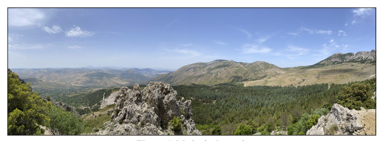
Figure 1. Madonie Geopark