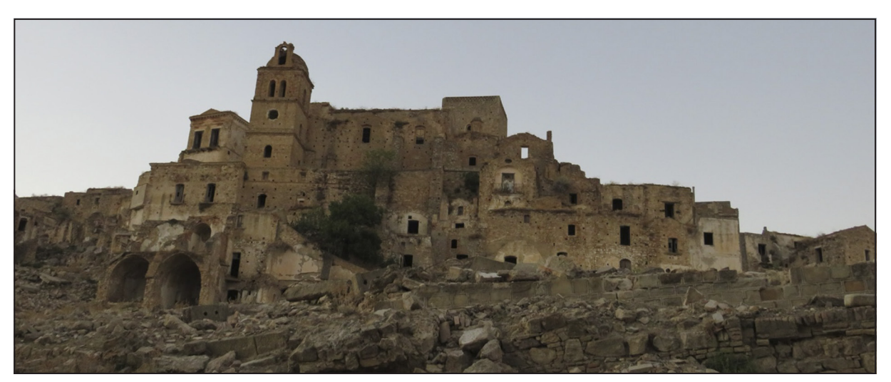
Figure 4. Craco Vecchia, Basilicata, Italy