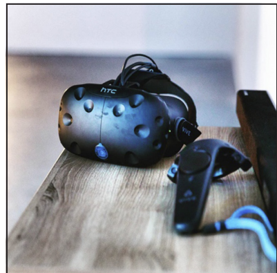
Figure 5. Virtual Archaeological Musem, Bompietro, Sicily, Italy