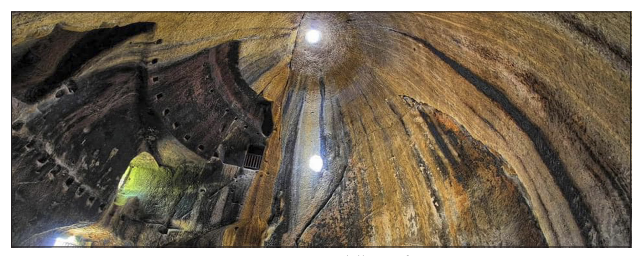
Figure 2. Grotta della Gurfa

Still today, the archaeology of the Madonie is a continually evolving field of research. Discoveries are made every year, contributing to improving our knowledge of this territory rich in history and culture. On the contrary, despite the numerous architectural, naturalistic, and archaeological peculiarities of the "Parco delle Madonie" region, it is regrettable to note the presence