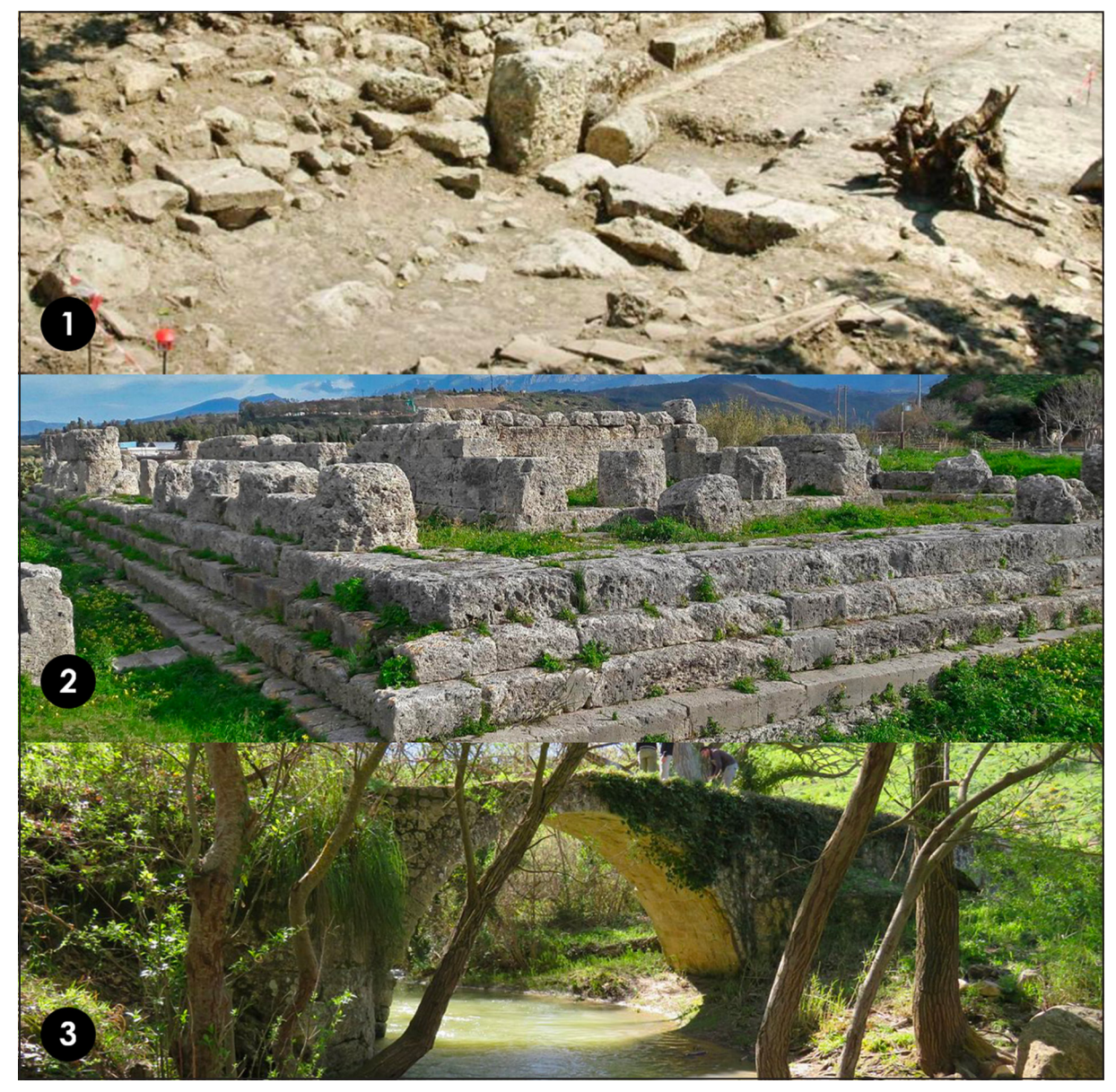
Figure 6. Villa Romana in Petralia Sottana, Himera, Roman arches in Blufi, Madonie, Sicily, Italy