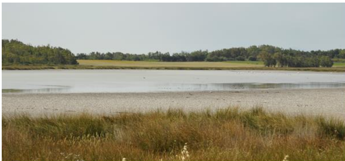
Fig. 1 Pauli Murtas pond (Oristano, Sardinia) close to drying up mid-May 2024.

During fieldwork in Sardinia, the authors found specimens largely deviating from the known range of morphological variability of C. tomentosa . The investigation was conducted in a temporary brackish endorheic pond called Pauli Murtas (Fig. 1) (Province of Oristano, 40.0030°N, 8.4640°E (WGS 84)), on 14 May 2024. The basin is located 7 meters above sea level. The maximum extension exceeds the 25 ha; the internal part, free of helophytic vegetation, occupies more than half of this surface. At the time of the inspection, due to the low rainy season and the natural drying out in spring, the surface occupied by water did not exceed 6 ha. A small population of charophytes extended over approximately one sixth of the submerged surface, with plant cover less than 1 %. The pond water conditions were extreme in terms of conductivity (63 mS cm -1 , which is about 43 PSU), maximum depth (10 cm) and temperature (29.6°C at 3 p.m.) and the individuals were abundantly covered in filamentous algae.