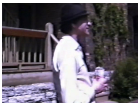
Figure 1. Self Portrait (Jonas Mekas, 1980)

hesitates and interrupts his speech by looking for words or making digressions. At the same time, it is clear that he is always performing for the camera, such as when he stops suddenly, shows his right and left profiles, and then turns his back to the camera, clearly linking his gestures both to the use of bureaucratic/law-enforcement portraiture and to the tradition of visual art as discussed above (fig. 1).