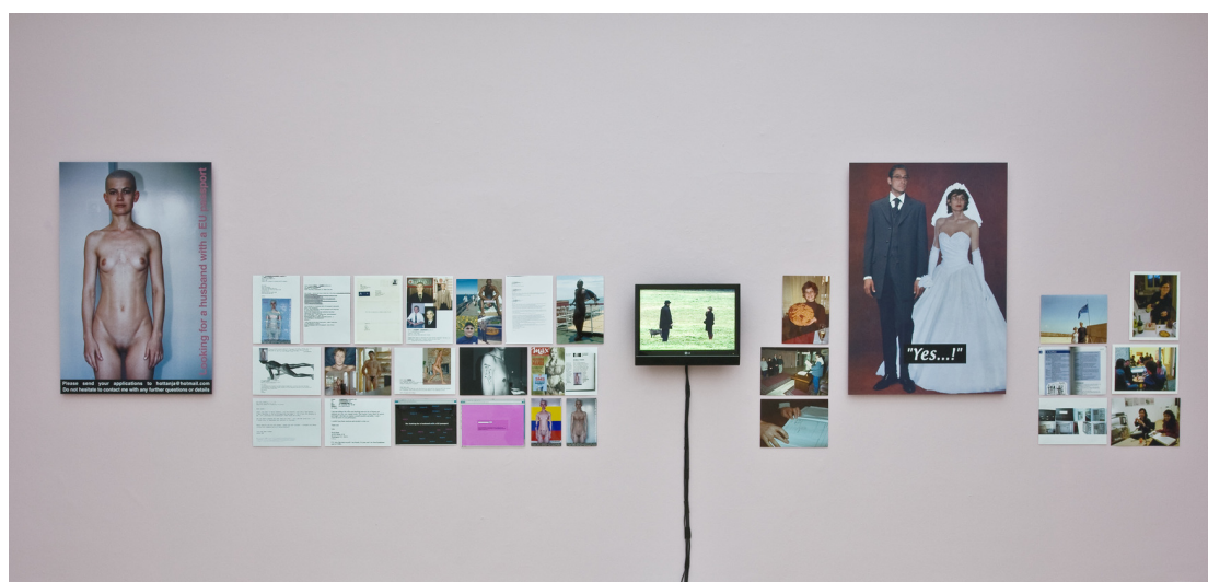
Figure 3. Tanja Ostojic: Looking for a Husband with EU Passport , 2000–05. Participatory web project/combined media installation. Installation view, Integration Impossible?: The Politics of Migration in the Artwork of Tanja Ostojic , Kunstpavillon Innsbruck, Austria. 10