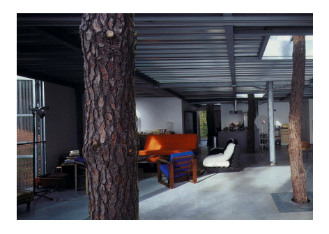
Figure 2. Lacaton & Vassal, House in Cap Ferret. Source: (Lacaton & Vassal)

And again, in Mêda, Portugal, a large chestnut tree protects and shelters under its canopy the refuge designed by João Mendes Ribeiro (2018-20). Starting from a parallelepiped shape, the wooden structure undergoes deformations and inclinations that determine an internal-external, geometric and organic spatial continuity, an extreme and indissoluble mixture of architecture in nature (Mendes Ribeiro 2021).