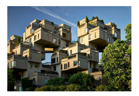
Figure 1. Moshe Safdie, Habitat '67 in Montreal.

These utopian visions, despite some built projects, did not have a real practical response. Probably, the search for a new combination between artifice and nature in the last century finds its maximum expression in the proposal of Moshe Safdie for Habitat '67 in Montreal.1 The multifunctional complex (residences, commercial and services spaces) offers an experimental solution for dense living, with modules entirely prefabricated in concrete, superimposed in different configurations to include vegetation, create paths and open spaces at high altitude, green terraces, small gardens. The 354 modules are divided into three pyramidal mounds, almost artificial and habitable hills, which also suggest an allusion to a primordial and natural system of aggregation of elements (Fig. 1).