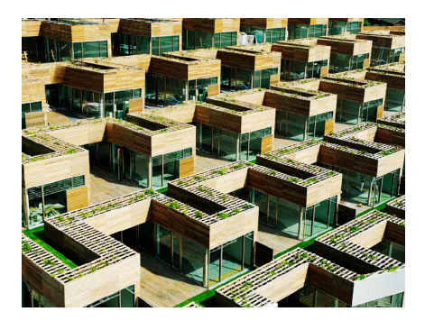
Figure 4. BIG, Mountain dwellings in Copenhagen.