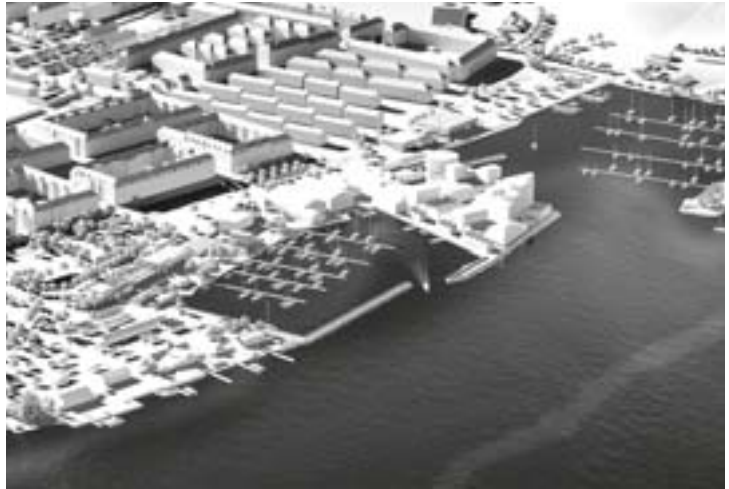
ID 101 Dynamic Climate Adaptation Strategies. Bådparken Project for Coastal and Port Areas of Aalborg Vestby