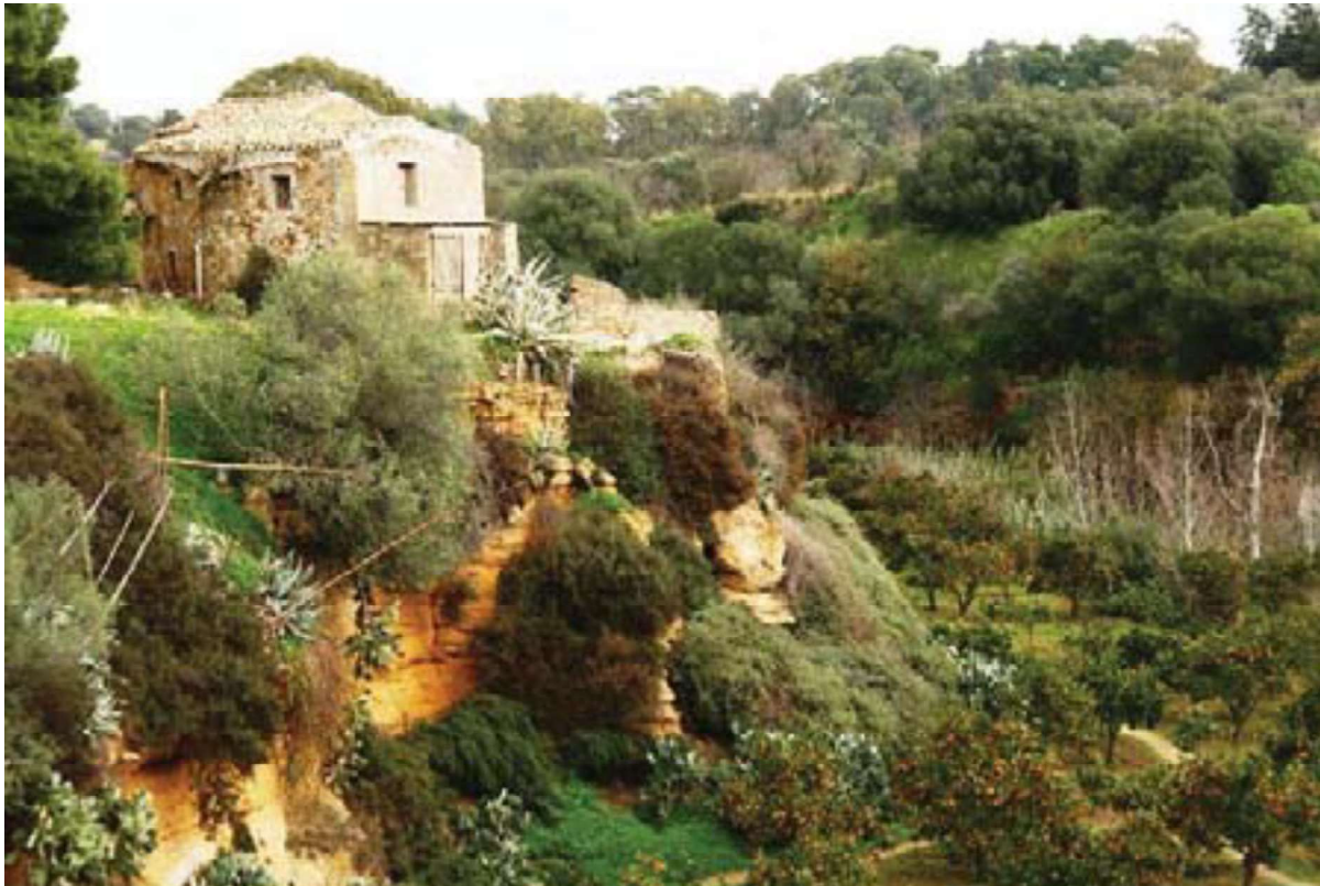
Fig. 5: Casa Montana - The recovery project plans to use the building as a museum of peasant culture.