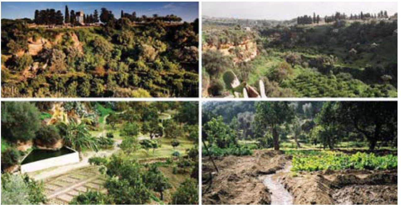
Fig. 3: The Garden after the redevelopment work.