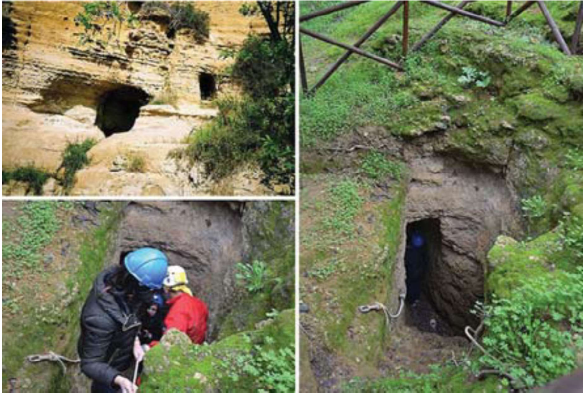
Fig. 4: Entrance to the hypogea