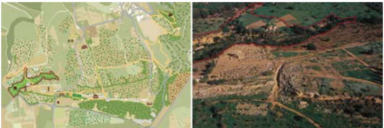
Fig. 1: The Kolymbethra Garden within the Valley of the Temples Archaeological and Landscape Park. In red the borders of the Garden.

This paper describes an exemplary environmental and cultural redevelopment project, aimed at producing physical and psychological well-being for visitors and contributing to the economic development of the city of Agrigento. It is a multifunctional model of ' active ' conservation of an area of the Sicilian territory, allowing for a harmonious interaction between nature and culture through the protection of the landscape. This is why the Kolymbethra Garden constitutes an important part of the Sicilian landscape and cultural mosaic to be safeguarded, enjoyed and enhanced.