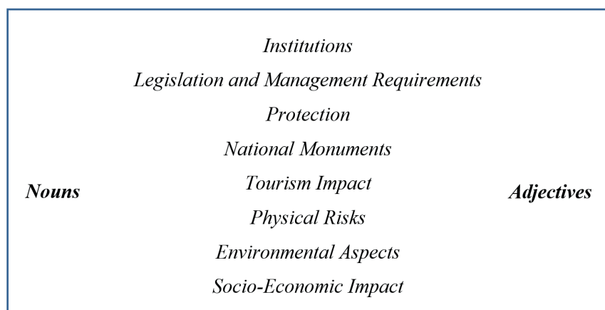
Figure 2: Key Semantic Fields in the Section: Protection and Management Requirements

Table 1 shows each key semantic field with percentage rates for each sub-corpus of websites. These data facilitate a comparative Tourism Discourse Analysis between the two sub-corpora of websites.