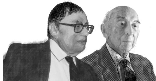
Fig. 1. Azriel Rosenfeld (1931–2004) and Lotfi Aliasker Zadeh (1921–2017)

The application of fuzzy set theory in abstract algebra can be certainly traced back to 1971 when Azriel Rosenfeld (1931–2004, see Figure 1 on the left) published a paper entitled “ Fuzzy Groups ” [21]. Although L.A. Zadeh is widely recognised as the father of fuzzy theory, “Rosenfeld is the father of fuzzy abstract algebra” [17, Preface, p. XII]. The article presents a fuzzy approach to generalise the definitions of algebraic structures of groupoids and groups, similar to Chin-Liang Chang’s work in 1968 on topological spaces [4].