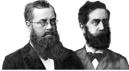
Fig. 2. Marius Sophus Lie (1842-1899) and Felix Christian Klein (1849-1925)

topology — that enables the application of methods from mathematical analysis — and endowed with a compatible group structure. In a Lie group, the group operation and the function associating each element with its inverse must be smooth functions. This means that they can be infinitely differentiated.