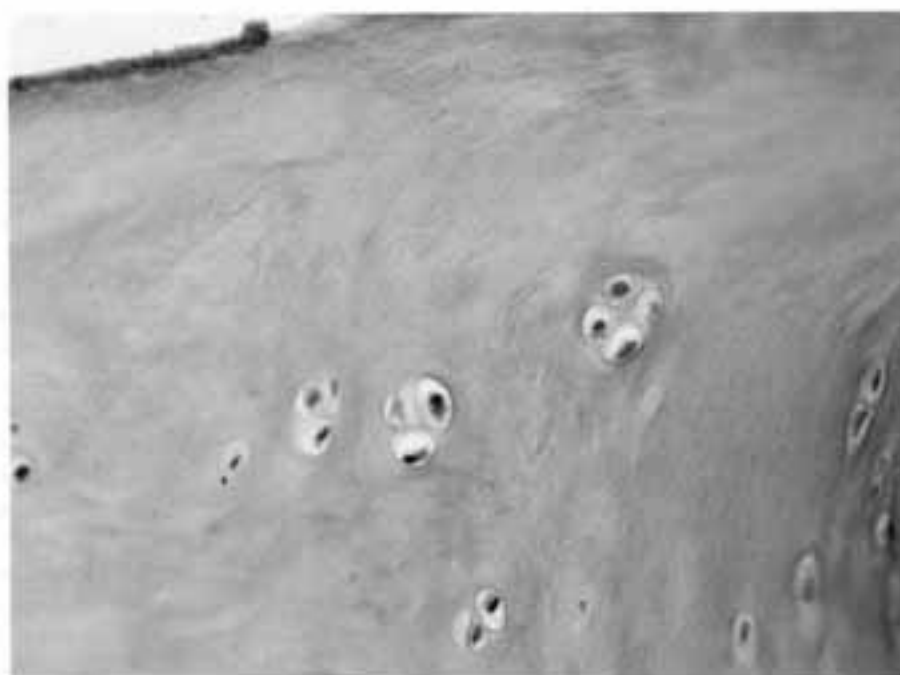
Fig. 3. Articular cartilage sample. MMP-9 immunoreactivity in the superficial zone and in groups of chondrocytes, X40.