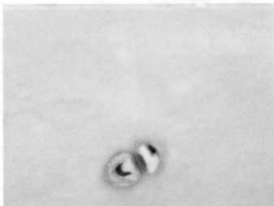
Fig. 4. Articular cartilage sample. MMP-9 immunoreactivity in the isogen chondrocyte group, 100X.

involved in the breakdown of extracellular matrix in physiological processes, such as embryonic development, reproduction, and tissue remodelling, as well as in diseases, such as arthritis and tumor