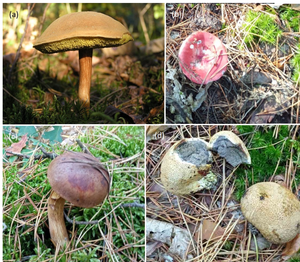
Figure 2. Selected examples of mycorrhizal fungi in a pine forest: fruiting bodies of Xerocomus subtmentosus (a), Russula paludosa (b), Imleria badia (c), and Scleroderma citrinum (d) in the litter of a pine forest.

Hilszczańska [19,20,95,118–121] studied in detail the structure of pine mycorrhiza, the properties of mycorrhizal fungi, and the influence of substrate moisture on the mycorrhization of plants in forest nurseries. According to the data obtained, seedlings with a CRS were characterized by a lower number of natural mycorrhizae than seedlings with an ORS. At the same time, the pine seedlings with mycorrhizal roots adapted better to the environment compared to the control plants but were inferior to them in terms of growth parameters (length of the above-ground part). The work also confirmed the positive effect of soil moisture on mycorrhizal biodiversity. Other studies have also confirmed that mycorrhization is sometimes accompanied by a slight slowdown in the growth of plant shoots [69], and this applies not only to Scleroderma but also to other types of mycorrhizal fungi [121] (Figure 2).