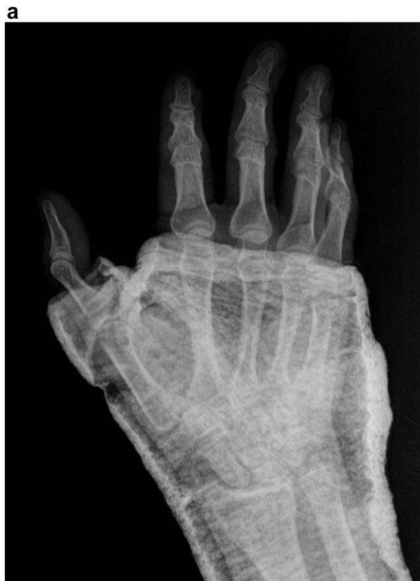
Fig. 2a. Radiographic control after immobilization of the right hand fracture with wrist cast.