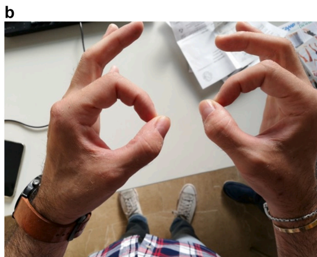
Fig. 3b. Follow-up at twelve weeks: functional tests on both hands.

any joint subluxation will be tolerated without increasing the risk of post-traumatic arthritis [7]. Despite this, other clinical studies have recommended the anatomic reduction [5]. The peculiarity of this case lies in the fact that it is a bilateral fracture of Bennett in the patient, this was caused by a motorcycle accident with both hands on the handlebar. Given the different outcome of closed reduction on both hands, the two fractures were classified differently and, therefore, treated in two different ways: one through the osteosynthesis with two wires of Kirschner, while the other fracture was treated with closed reduction and splinting. The case assessment and the choice of treatments was favorable with very good clinical result and the patient very satisfied at follow-up of 3 months.