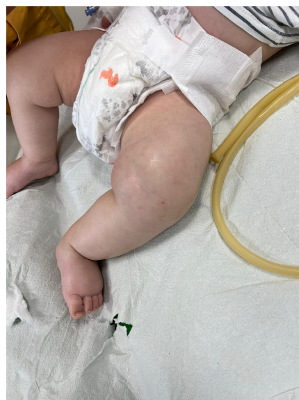
Figure 1. Edematous left lower limb with tense skin in a 3-month-old infant affected by osteomyelitis and soft tissue infection.

The patient's parents did not report any prior medical conditions, and the infant exhibited good adaptation to extrauterine life and regular growth. The following findings were noted upon physical examination: SpO 2 , 98% in room air; heart rate, 170 bpm; respiratory rate, 35 breaths/min; and temperature, 38.5 °C. The left lower limb appeared externally rotated and flexed. The supra-patellar and thigh regions were edematous, with taut, warm, and tender skin (Figure 1).