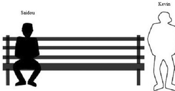
Fig. 1. Image 1 from the SEBT (UK version).

NOTES. * p < .05 ; ** p < .01 ; *** p < .001 .