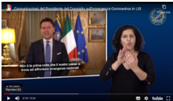
1: Translation into LIS: AFFRONTARE (to face) – Press Conference, March 5, 2020

opted are: “affrontare” (“to face”), “forte” (“strong”), “non si arrende” (“does not give up”), “sfida” (“challenge”). Of each of these we find the translation into LIS by the interpreter: