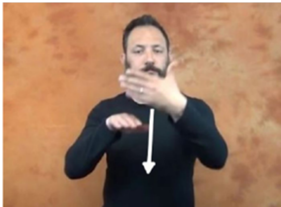
8: COPRIFUOCO, composed of ORA + LIMITE (curfew, composed of hour + limit) – Spread The Sign

Consulting the dictionary Spread The Sign 25 , we found this sign standing for the term curfew: