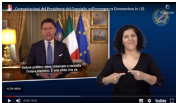
4: Translation into LIS: SFIDA (challenge) – Press Conference, March 5, 2020