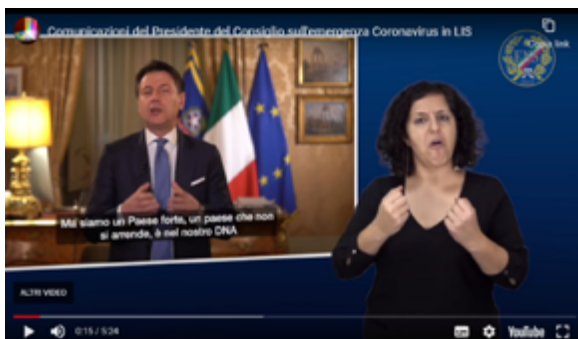
2: Translation into LIS: FORTE (strong) – Press Conference, March 5, 2020