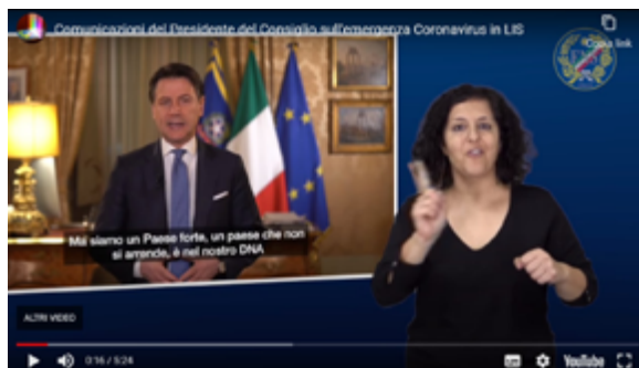
3: Translation into LIS: ARRENDE+NO (does not give up) – Press Conference, March 5, 2020