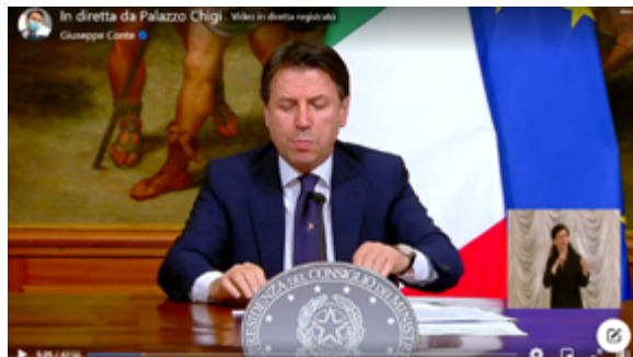
6: Translation into LIS: battere (to fight) – Press Conference, April 26, 2020

Similarly to the situation that we observed previously, these two examples here are actually quite different: the first displays an idiomatic expression that includes a war metaphor, while the verb used in the second example belongs to the language of war.