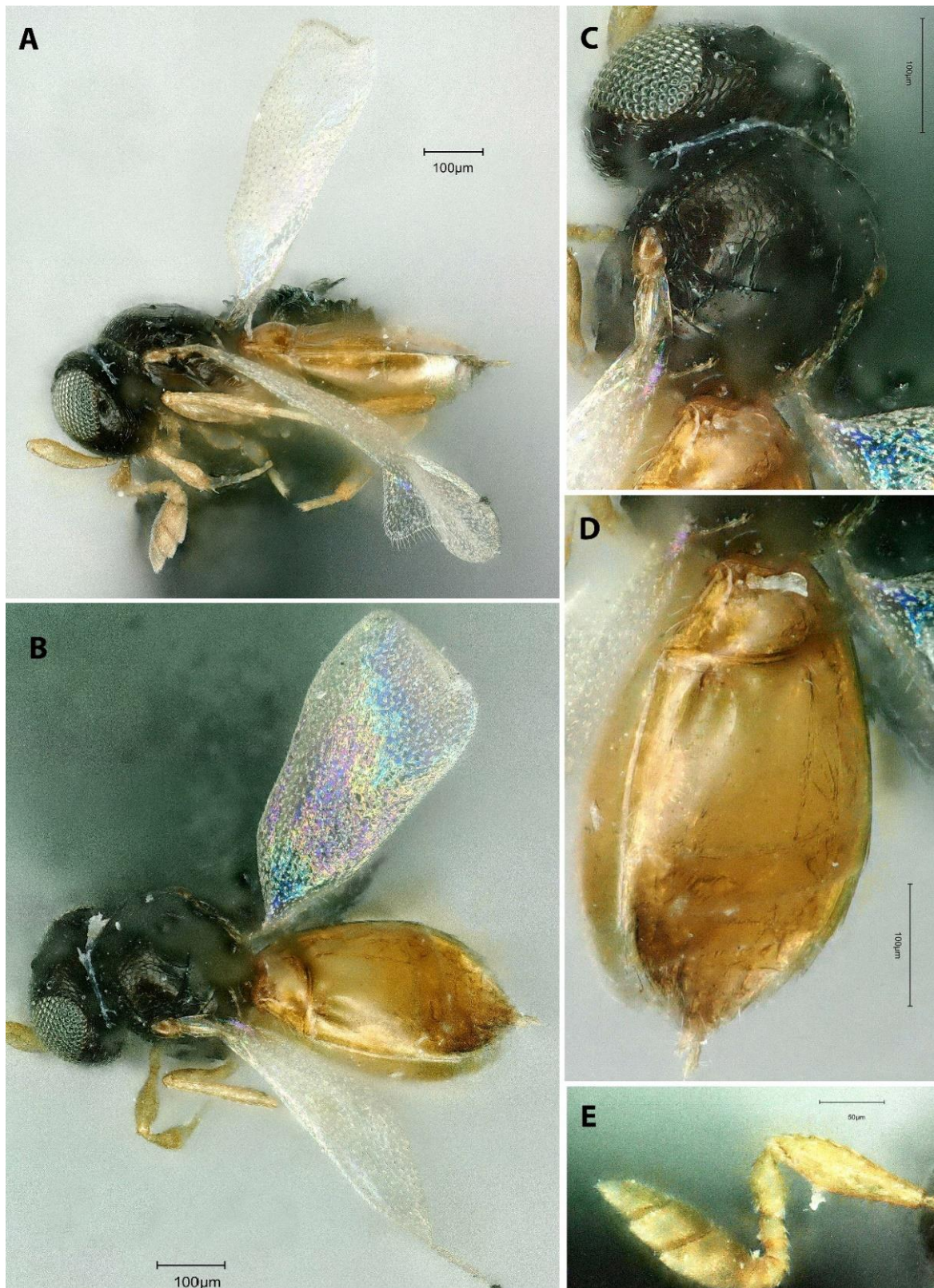
Figure 3. Female Fidiobia hofferi Kozlov, 1978: A. General habitus in lateral view; B. General habitus in dorsal view; C. Head and mesosoma in dorsal view; D. metasoma in dorso-lateral view; E. Antenna.