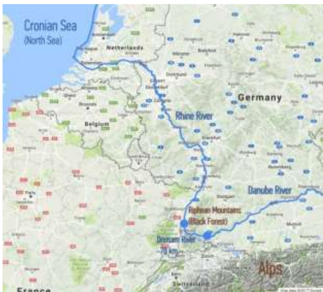
Figure 6: Danube's minimum distance from the Rhine is approximately 70 km in straight line. Their connection is possible thanks to the existence of numerous rivers rising from the Black Forest (towards both the east and the west) and of their valleys, which make the path easier, avoiding higher altitudes. Here the largest valley is chosen, the one of rivers Dreisam-Elz.