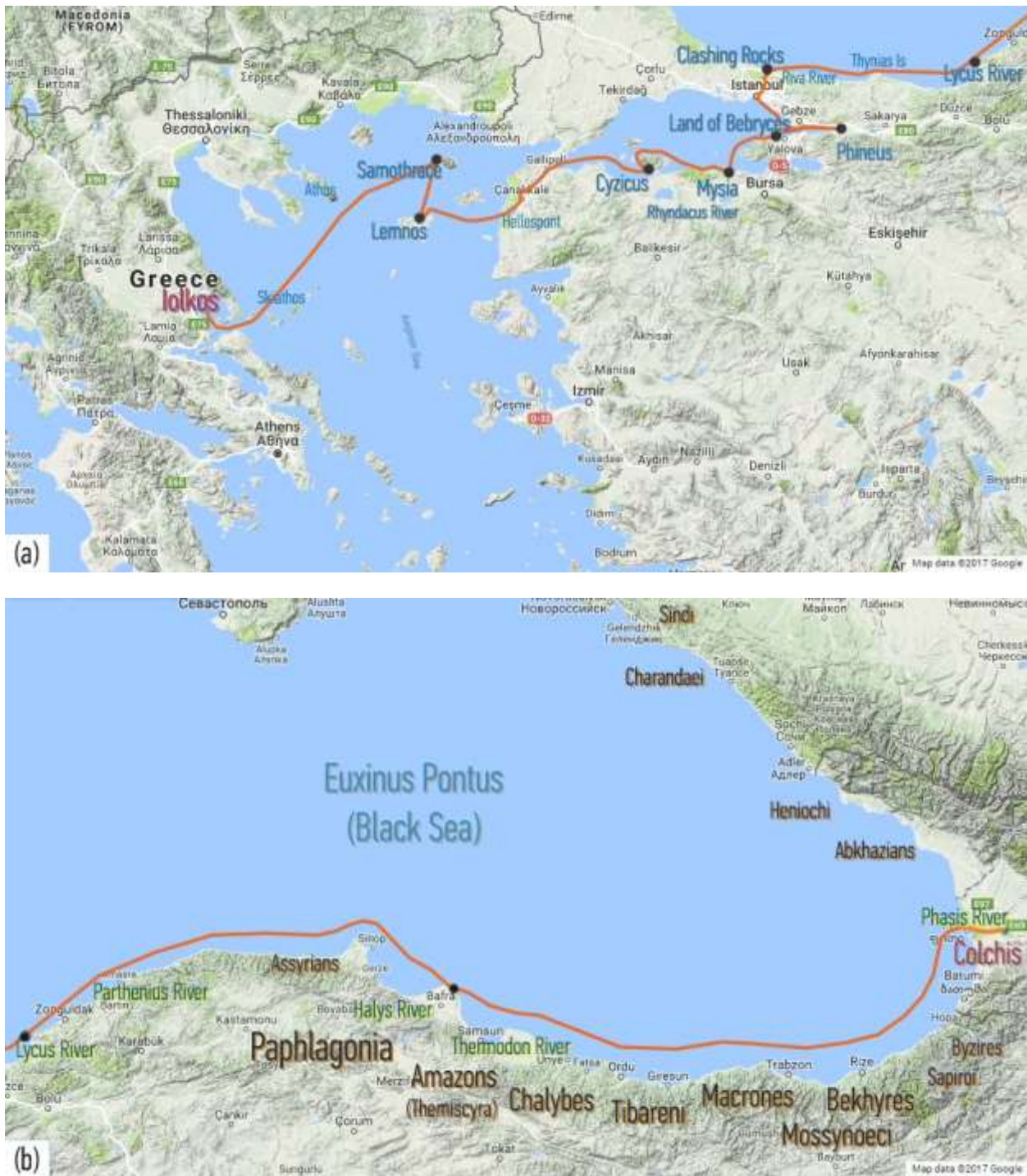
Figure 1: (a) The route followed by the Argonauts from Iolkos to the Symplegades, the Clashing Rocks. Places and tribes they reportedly passed from or met with are indicated. (b) The route followed by the Argonauts from the “Clashing Rocks” to Colchis. The tribes whose regions are known today are indicated

Advancing next to the southern shores of the Black Sea, the Argonauts passed from Paphlagonia to the country of the Amazons, Themiscyra, drained by Thermodon River (now Terme). Several other tribes inhabited the regions adjacent to it, from the east: Chalybes, the Tivarene nations, Vecheiroi, Macrones,