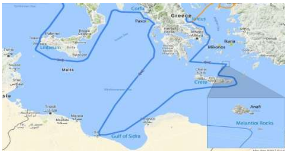
Figure 15: The return route of the Argonauts, from Sicily to Iolcos. In the inset are shown the two rocky islets (Melantian Rocks), nowadays known as Pacheia and Makra, located to the south of Anafi.

Mediterranean, to the African Gulf of Sidra. Rescued, they headed towards Crete, where the metallic giant Talos did not allow them to disembark. They struggled with the large waves of the Sea of Crete trying to reach the “Melantian Rocks”. According to Strabo, these Rocks are located between the islands of Mykonos and Icaria ( Geographica , XV, 1, 13, 3), relatively close to Delos Island. This is in accordance with the myth that Paeon (the god Apollo) threw an arrow from Delos (his birthplace) to point to the Argonauts as a shelter from the storm, a new island, at the center of the ancient Sporades Islands (the modern Cyclades). Because that island anefani (reappeared) out of the darkness and the tempest, it was named Anafi (v. 1363-1384). However, from the geography of the region (Figure 1) it is evident that Anafi lies far to the south of Mykonos; it actually lies nearer to Crete. Consequently, they could not have overtaken it. Then, probably the Melantian Rocks are the two rocky islets (nowadays known as Pacheia and Makra), just to the south of Anafi.