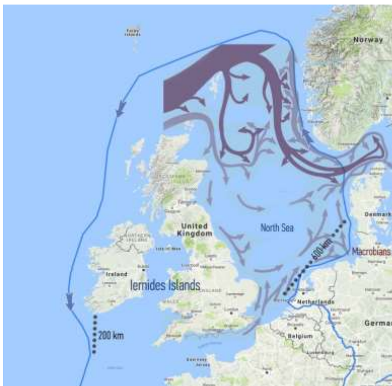
Figure 7: The route of the Argonauts in the Cronian Sea. The map indicates: 1. A part of the ocean currents of the North Atlantic Ocean (red color). 2. The Argo route from the estuary of Rhine (Rotterdam) to the circumvention of Iernides islands (Great Britain and Ireland). 3. The six-day sailing of approximately 600 km towards the Macrobian lands. 4. The route of 200 km south of Ireland, during which they could not see any land.

Concerning the tribe of the Macrobian s there are the following references in the ancient literature: