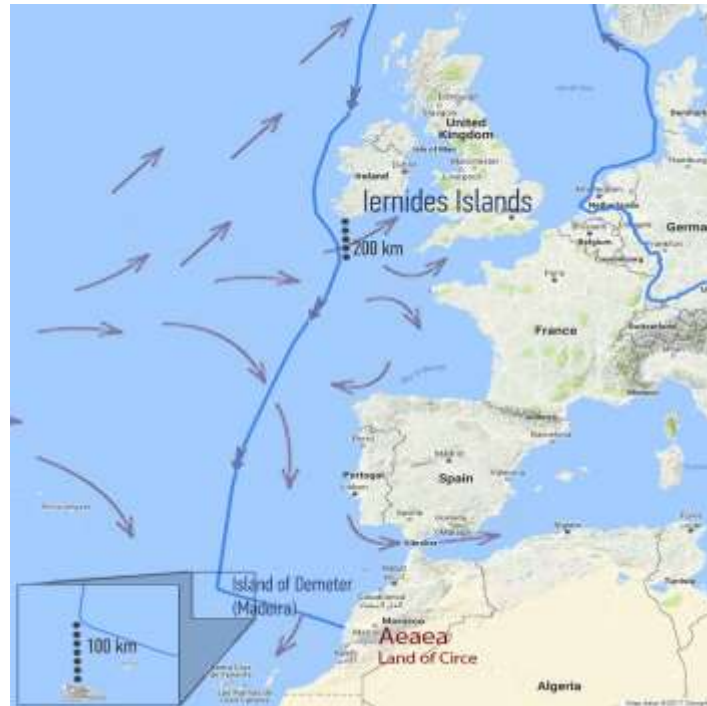
Figure 9: The route to Circe in the Atlantic Ocean. A part of Atlantic Ocean currents are shown as well as the position of Madeira Island, which corresponds to the “Island of Demeter” mentioned in the text. It is assumed that 200 km south of Iernides Islands no land can be discerned, while Madeira could most probably be visible from a maximum distance of approximately 100 km.

agree to a goddess of agriculture such as Demeter; today it is a well-known year-round resort, being visited every year by about one million tourists. The Argonauts knew that they should not approach this particular “sacred island”. However, their view of this known island meant that they had overshot Gibraltar and so they should change their course immediately (v. 1187-1190).