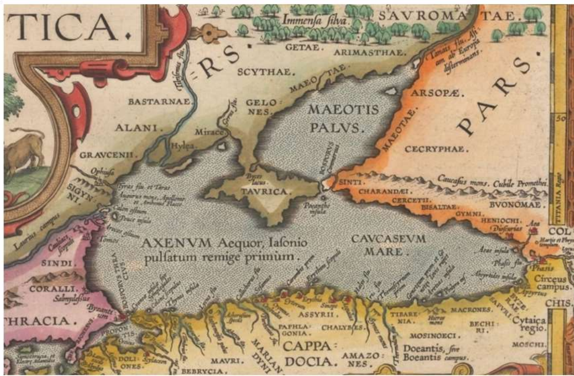
Figure 3: The tribes inhabiting the shores of Euxinus Pontus (the Black Sea) according to Ortelius (1624).

“foolishness” and loss of orientation, as they departed nightly and under pressure (v. 1036-1044).