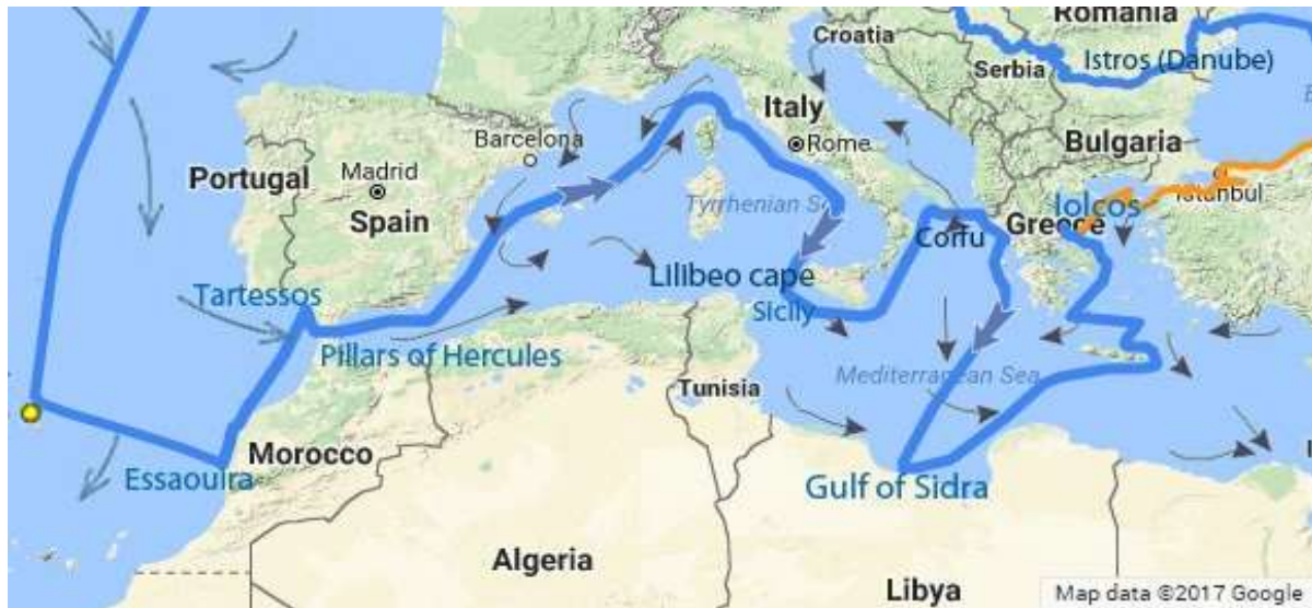
Figure 11: The route of the Argonauts in the Mediterranean Sea.

reference to "Etna's flame" indicates that the Etna volcano was active during that age. This is in accordance with Beccaluva et al. (1981) which determined an age of 10 million years referring to the dating of stones located to the strait between Sicily and Libya. The studied stones were sampled from relatively small depth in the sea, about 380 m. The results of this study agree with previous reports that in this region the tectonics are very active . This leads to the conclusion that the undersea volcanic activity is appeared in many places, with strong gas escaping visible on the sea surface.