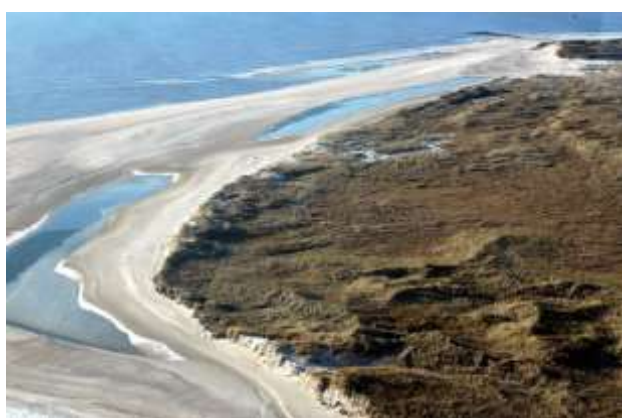
Figure 8: The Ho Bugt wetland on the west coast of Jutland peninsula (Denmark), at the estuary of Varde River.

Additionally, we note that, while the ship was previously being pulled upon pebbles, it is written that in this region "the vast waters of the Ocean hum over the sand" (v. 1150-1151). In this region, the Argonauts experienced a change in weather, as the calm turned gradually into a strong westerly wind ( Zephyros ), so they embarked in their ship and prepared to sail towards the Ocean (v. 1131-1141).