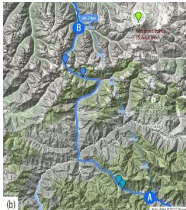
Figure 2: (a) The route from Colchis to Maeotis (“Maeotic Swamp”). The easiest route corresponding to the text is to follow Phasis (Rioni) to point A and from there through tributaries reach point B, the source of Hypanis (Kuban).