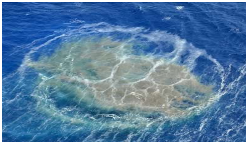
Figure 13: The El Hierro submarine volcanic eruption in Canary Islands in 2011 (Spain).