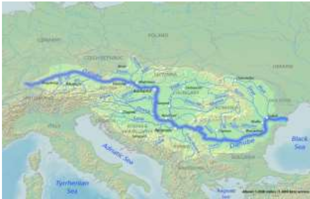
Figure 5: The Danube River

Atlantic Ocean, while according to the above view they are in Central Europe.