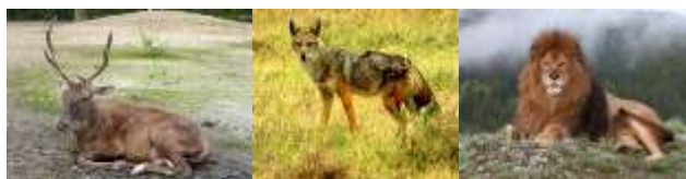
Figure 10: The region of Essaouira in Morocco, with the Mogador Island and the river Qued Ksob. In this area still live the animal species Barbary stag (left), African golden wolf ( Canis anthus , in the middle), and Barbary lion ( Panthera leo - Atlas lion, right).

Since the text of Argonautica does not offer any description of the place where Circe lived, we remind the detailed description given by Homer in Odyssey (Book 10):