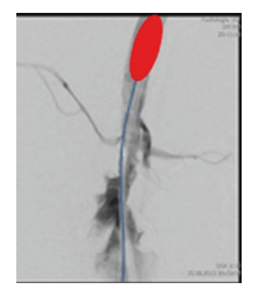
Fig. 11.1 Intraoperative angiogram. After placing a guide wire, an aortic balloon is delivered and inflated suprarenal (here supraceliac) to achieve proximal hemorrhage control

Based on the early positive experience and subsequent systematic follow-up of the patients at our center, we have routinely applied the principles of hypotensive hemostasis for nearly 20 years. The feasibility of EVAR in rAAA using hypotensive hemostasis, including permissive hypovolemia, controlled hypotension, and local anesthesia, was reported by our group in 2001 [19]. In this series of 21 patients, restricted volumes of fluids and erythrocyte transfusions were enough to maintain hemodynamic stability prior to the completion of EVAR (Fig. 11.2).