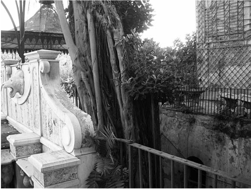
Fig. 1 — The plant that began the “casual alien” process of Ficus macrophylla f. columnaris . Behind it, just under the bench, one of the four discovered seedlings.