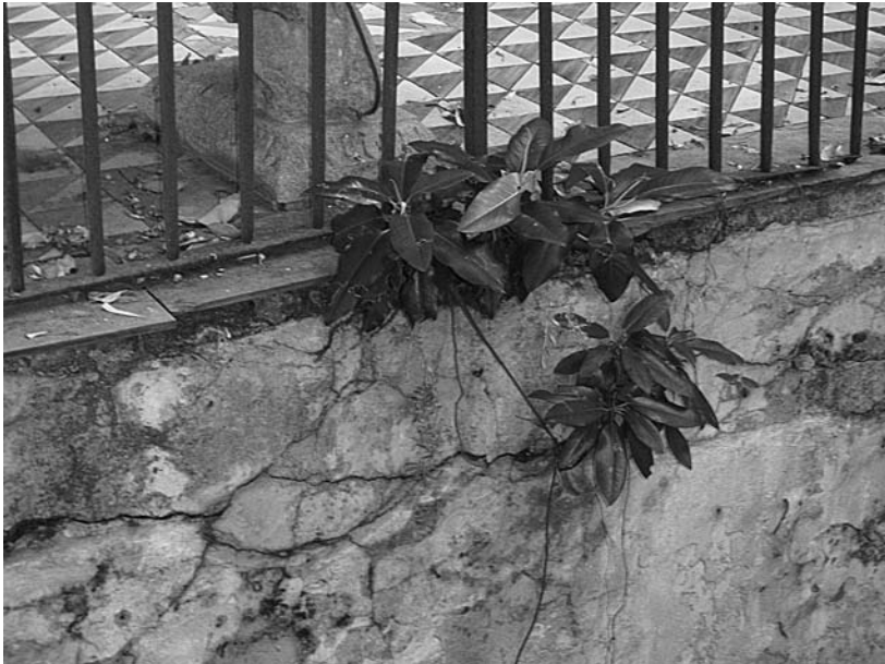
Fig. 2 — F1 seedling from Ficus macrophylla f. columnaris .