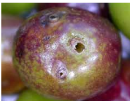
Figure 3. Exit holes of fully grown olive fruit fly larvae with residues of the fruit cuticle clearly visible.