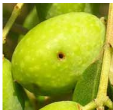
Figure 4. Exit hole of olive seed wasp with well-defined edge (no residues of fruit cuticle).