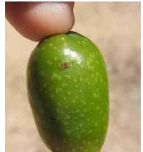
Figure 2. Puncture wound by ovipositor of Olive fruit fly female.

the wound (Fig. 1). These shallow, sterile or fertile punctures by the female's ovipositor close rapidly without allowing microorganisms to penetrate and degrade the olive pulp