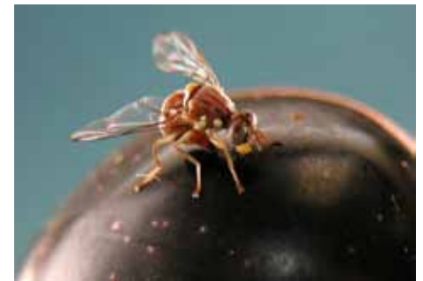
Figure 1. Olive fruit fly female sucking a droplet of juice from a puncture wound in olive.

mature. They puncture the skin of the olive with the ovipositor and suck the juice from