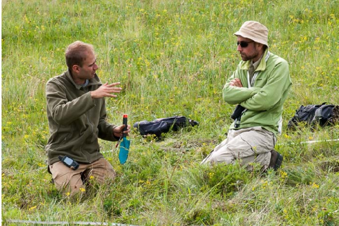
Photo 10. Taking a soil sample during the EDGG Field Workshop in Khakassia, Russia, 2013 (Photo: J. Dengler).