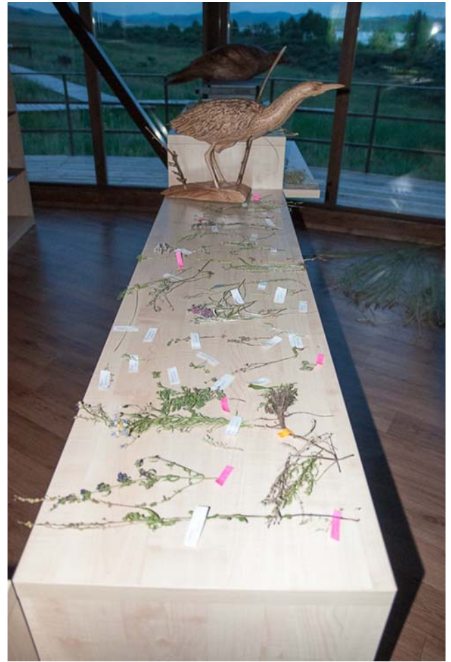
Photo 16. Collection of reference specimens for comparison during the EDGG Research Expedition in Khakassia, Russia, 2013 (Photo: J. Dengler).

E.8 Quality assessment: There are relatively many studies (see review by Morrison 2016 ) that measured the impact of observer-related discrepancies in vegetation sampling and warn against the resulting biases in species richness, cover estimates, and visual estimates of other vegetation features. However, this issue is still surprisingly disregarded or overlooked in the vast majority of published researches based on analysis of plot-based data across spatial and environmental gradients. Nevertheless, most studies on observer-related error found mean values of pseudo-turnover (i.e. of the difference in species composition between two observers, or teams of observers, surveying the same plot) ranging from 10% to 30% ( Morrison 2016 ). In a study with fine-scale plots in temperate European grasslands, Klimeš et al. (2001) found that the discrepancy in vascular plant richness between individual observers ranged from 10% to 20%. These figures are large enough to potentially bias statistical inference and to flaw the search for correlation between environmental vari-