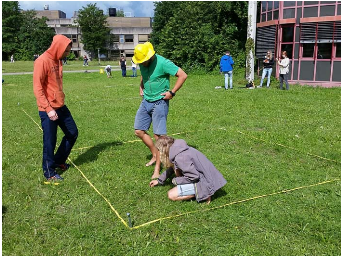
Photo 21. Sampling of an EDGG Biodiversity Plot with a Bachelor-level practical course in plant ecology on the lawns of the University of Bayreuth, Germany, 2016.