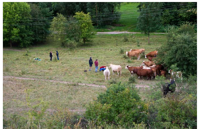
Photo 22. A group of "grassland managers" showing some interest in an EDGG Biodiversity Plot during a Master-level field course in NE Brandenburg, Germany, 2016.

J.D. proposed the general idea of the sampling in 2008, "invented" the EDGG Field Workshops in 2009 and since then