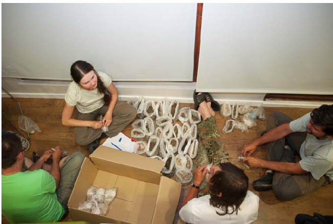
Photo 11. Drying and sorting of soil samples during the EDGG Field Workshop in Navarre, Spain, 2014.