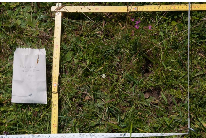
Photo 17. One of the richest 0.1-m 2 subplots of an EDGG Biodiversity Plot during the EDGG Field Workshop in Navarre, Spain, 2014.

The EDGG sampling methodology was devised to be an effective multi-purpose sampling strategy. Since its first application during the Research Expedition in Transylvania (Dengler et al. 2009, 2012a) it has proven to fulfil this expectation quite well. The experiences of many of the researchers in-