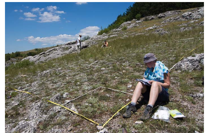
Photo 4. EDGG Biodiversity Plot during the EDGG Field Workshop in Serbia, 2016.