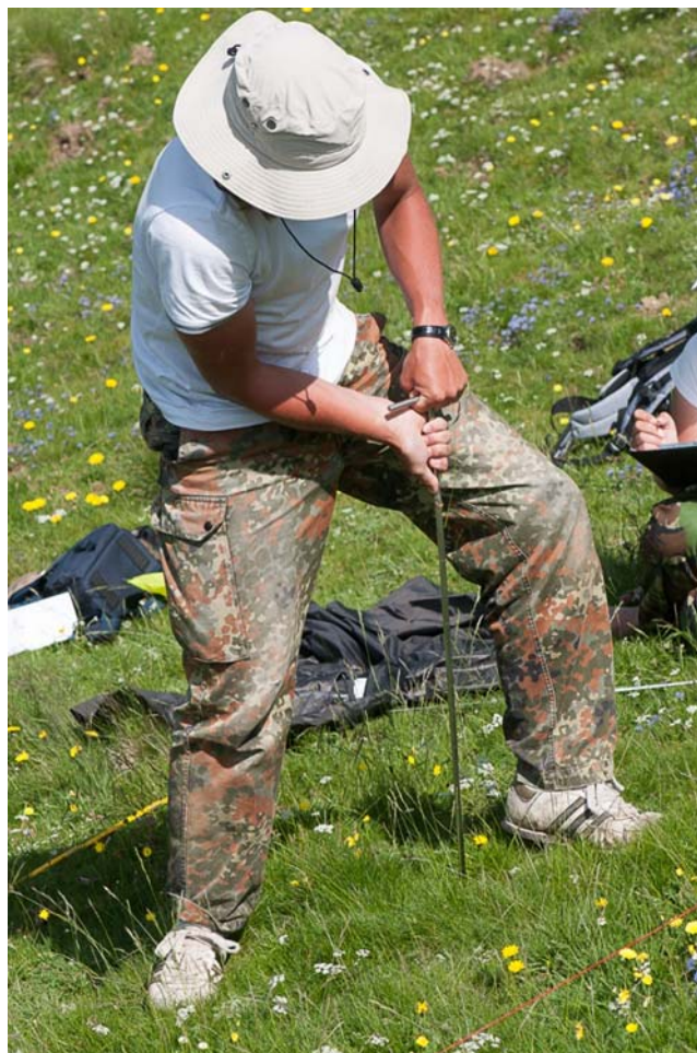
Photo 9. Applying the penetrometer to determine the accessible soil depth during the EDGG Field Workshop in Navarre, Spain, 2014.

To facilitate and standardise data collection and management, the EDGG provides and regularly updates a series of documents, i.e. instructions, templates for printed forms and spreadsheets, the currently up-to-date versions of which accompany this article. All these documents are open access and can be modified according to personal needs. Online Resource 1 contains a detailed list of equipment needed for sampling like that done during EDGG field pulses, depending on the duration and number of participants ( Photo 12 ). Online Resource 2 provides detailed practical instructions on how to implement the EDGG sampling in the field, while Online Resource 3 describes the data handling and recording after the fieldwork. Online Resources 4 and 5 are the current templates for biodiversity plots and for normal plots. Online Resources 6 and 7, finally, are spreadsheets (*.xlsx format) for the efficient data entry of species data and header data, respectively. They include some embedded functions that facilitate work and provide some simple data checks (filling in the species list for 100-m 2 plots automatically based on the two corners, checks of consistency of cover values, calculation of mean and standard deviation for parameters with multiple measurements, descriptive statistics for parameters across all plots to check for