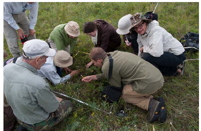
Photo 18. Learning to know the species in one of the first EDGG Biodiversity Plots during the EDGG Research Expedition in Khakassia, Russia, 2013.