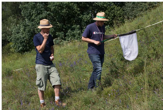
Photo 14. Sampling grasshoppers on a 100-m 2 EDGG Biodiversity Plot during an advanced student field course in NE Brandenburg, Germany, 2016.

In the Swiss Biodiversity Monitoring, apart from vascular plants and bryophytes, also land snails ( Gastropoda ) are sampled on the same 10 m 2 plots (Koordinationsstelle BDM 2014). Other invertebrate groups that are potentially suitable