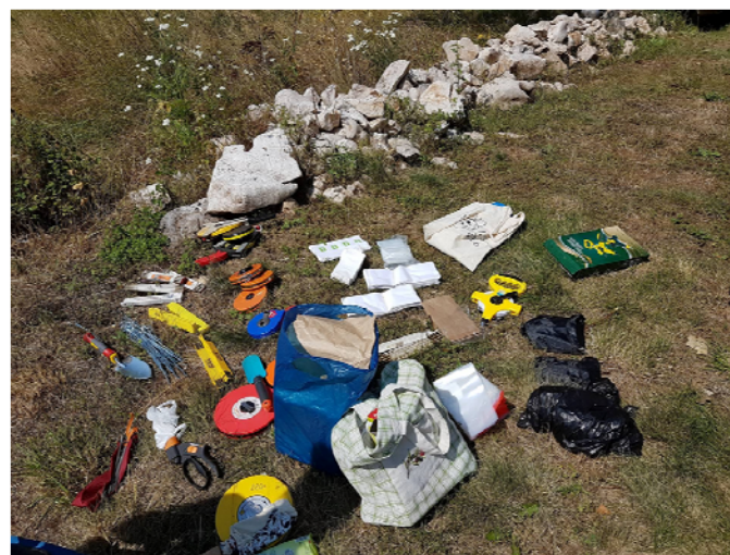
Photo 12. Equipment needed for the EDGG sampling methodology, spread to be packed by the different teams during the EDGG Field Workshop in Serbia, 2016.