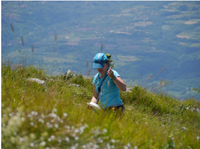
Photo 7. Using a preliminary version of the disc for standardised assessment of vegetation height during the EDGG Field Workshop in Serbia 2016 (Photo: I. Dembicz).

recording. The observer should always look from the same angle into the plot and start recording plants from the highest to the lowest layers, without recording additional plants of the higher layer after they have been bent away to sample plants of the lower layers, nor after the plots have been affected by wind, etc. Our experience suggests that representative results can be achieved with the shoot presence method if one observer works fast and thoroughly.