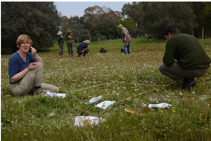
Photo 1. EDGG Biodiversity Plot during the EDGG Field Workshop in Sicily, Italy, 2012 (Photo: T. Becker).

A.2 The study-plot sizes are 1 cm 2 ; 10 cm 2 , 100 cm 2 , 1000 cm 2 , 1 m 2 , 10 m 2 and 100 m 2 (Fig. 1). Using plot sizes always differing by one order of magnitude is also the philosophy of other widespread multi-scale approaches. For example, Shmida (1984), Peet et al. (1998) and Jürgens et al. (2012) use the same set of plot sizes, excluding only the smallest ones and adding 1000 m 2 . These plot sizes also include three of the most frequently used plot sizes in phytosociology, namely 1, 10 and 100 m 2 (Chytrý & Otýpková 2003). Having the plot sizes on a geometric scale is beneficial for many ana-