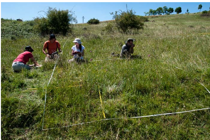
Photo 3. EDGG Biodiversity Plot during the EDGG Field Workshop in Navarre, Spain, 2014.