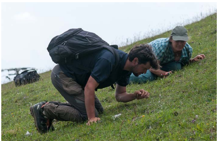
Photo 20. Thorough search for tiny plants in an EDGG Biodiversity Plot during the EDGG Field Workshop in Navarre, Spain, 2014.