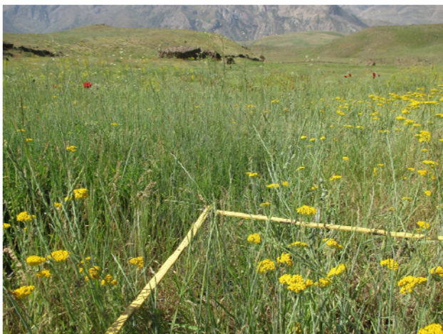
Photo 5. EDGG Biodiversity Plot in an alpine steppe of Mt. Damavand, Iran, 2016.