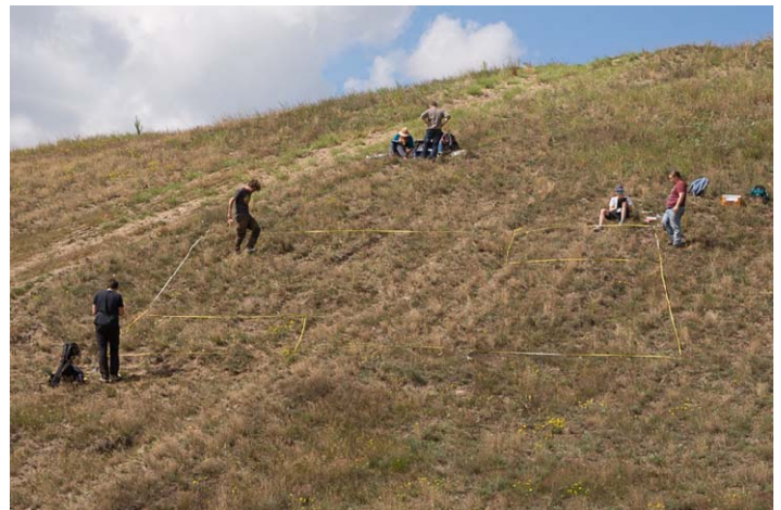
Photo 6. EDGG Biodiversity Plot during an advanced student field course in NE Brandenburg, Germany, 2016. The student group in the background is determining grasshoppers that just have been collected on the diagonal of the 100-m 2 plot.