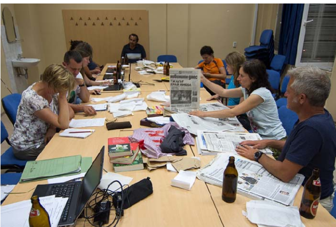
Photo 15. Plant determination, preparation of herbarium specimens, data correction and data entry during the EDGG Field Workshop in Serbia, 2016.

We consider that the quality of data obtained from the EDGG field pulses is superior to that obtained in typical phytosociological studies for the following reasons: (a) we use clearly delimited plots and spend much more time on these than phytosociologists usually do; (b) at least two people jointly sample each plot; (c) the composition of sampling teams varies, while all participants sample all subtypes of grasslands in a region, (d) the participants of the field pulses always include several local organisers who are deeply familiar with the flora