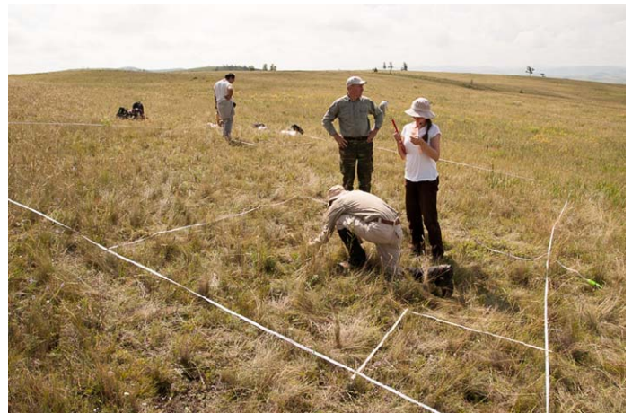
Photo 2. EDGG Biodiversity Plot during the EDGG Research Expedition in Khakassia, Russia, 2013.