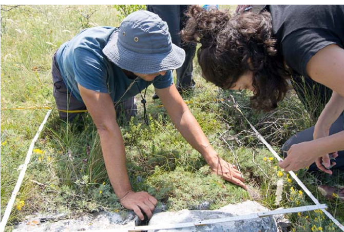
Photo 19. Detailed searching for plants in an 1-m 2 subplot of an EDGG Biodiversity Plot during the EDGG Field Workshop in Serbia, 2016.