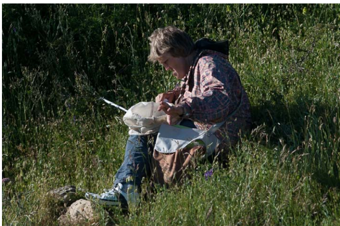
Photo 13. Sampling vegetation-dwelling spiders on a 100-m 2 EDGG Biodiversity Plot during the EDGG Field Workshop in Navarre, Spain, 2014.

changes in microclimatic conditions, prey abundance, sites for building webs, sheltering and/or oviposition (Gunnarsson 1990; Halaj et al. 1998; McNett & Rypstra 2000). Therefore, collaboration of botanists and zoologists in biodiversity assessments is highly desirable.