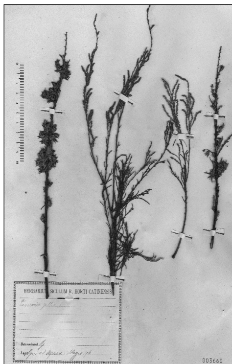
Fig. 13. The exsiccatum of Tamarix boveana kept in the Herbarium Siculum R. Horti Catinensis (CAT!) [sub Tamarix gallica L.].