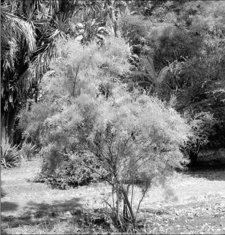
Fig. 5. Tamarix chinensis cultivated in the Botanical Garden of Palermo.

Sepals ovate to trullate-ovate , the outer keeled and acute, the inner with obtuse apex, margin entire to dentate , (1.8) 2.0-3 mm long . Corolla pentamerous, persistent . Petals trullate to elliptic-obovate or, rarely trullate-ovate, 3-4.5 (5) mm long . Gynoecium with 3 carpels and 3 stigmas . Androecium of 5 antesealous stamens, insertion of filaments peridiscal, Anthers apiculate . Disk synlophic, sometimes synparalophic .