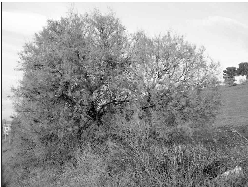
Fig. 2. The autumnal habitus of Tamarix gallica L.

Terranova presso il fiume Zappulla, Majo, Todaro, 4835 4 (FI); Revision label: Tamarix gallica L., [B. Baum, 1965]; Original label: In humidis reg. infer. Catania, V 1909, H. Ross, 4835 5 (FI); Revision label: Tamarix gallica L., [B. Baum, 1965]; Original label: Ad fossas vel in locis humidis planitici catanensis, 19 Junio 1874, P. Gabriel Strobl, 4835 6 (FI); Revision label: Tamarix gallica L., [B. Baum, 1965]; Original label: In arenosis maritimis - Terranova presso il fiume Zappulla, Majo, Todaro 4835 7 (FI); Revision label: Tamarix gallica L., [B. Baum, 1965]; Original label: Scoglitti In arenosis maritimis humidi, s.d., S. Sommier, 4835 8 (FI); Revision label: Tamarix gallica L., [B. Baum, 1965]; Original label: Scoglitti (Sicilia), 15 Maggio 1873, s.coll., s.n., 4835 9 (FI); Revision label: Tamarix gallica L., [B. Baum, 1965]; Original label: In arenosis maritimis - Terranova presso il fiume Zappulla, Majo 1828, Todaro, 4835 10 (FI); Revision label: Tamarix gallica L., [B. Baum, 1965]; Original label: Catania, Sept. 1845, Herbarium Parlatoreanum, 4835 12 (FI); Revision label: Tamarix gallica L., [B. Baum, 1965]; Original label: Lipari, 1858, s.coll., s.n., 4835 14 (FI); Revision label: Tamarix gallica L., [B. Baum, 1965]; Paternò: M e Castellaccio vicino il fiume Simeto, 14-5-1942, R. Corti e F. D'Urso, 4835 15 (FI).