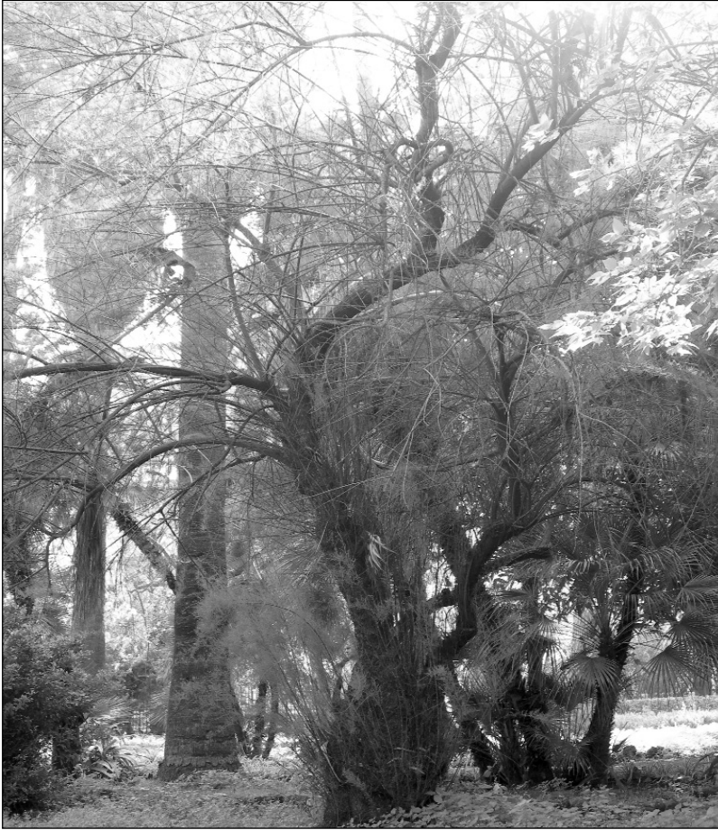
Fig. 3. Tamarix arborea var. arborea cultivated in the Botanical Garden of Palermo.

floodings, reforested areas on dunes, cultivated, on unstable escarpments, nurseries.