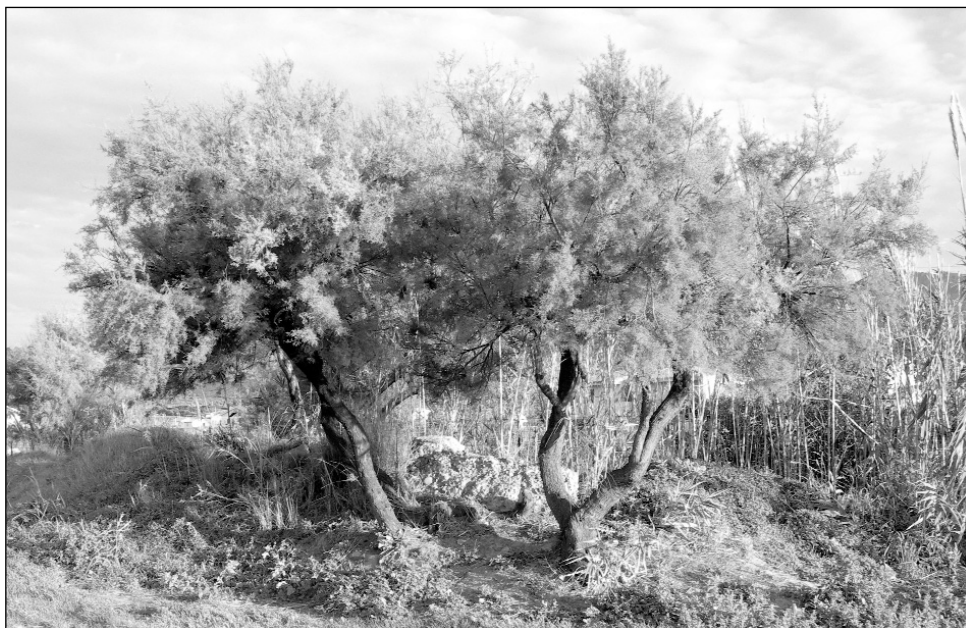
Fig. 10. Tamarix tetragyna on the relict dunes of Gorgolungo (Lascari, province of Palermo).