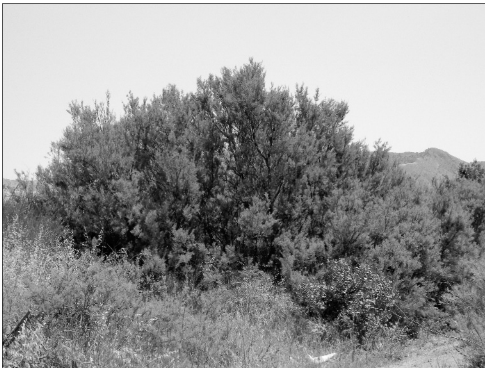
Fig. 6. Tamarix africana var. africana on the alluvial plane submitted to floodings in the Piana of Vicari (Palermo).

Selected specimens: Finale di Pollina (Palermo) , Valtur village, 25 Mar 1995, G. Venturella, s.n., (PAL); Mustigarufi (Caltanissetta) , 31 Mar 1994, G. Venturella, s.n., (PAL); SS 286, km 10 Castelbuono (Palermo) , s.d., G. Venturella, s.n., (PAL); Fiume San Leonardo (Termini Imerese, Palermo) , 13 Apr 1995, G. Venturella, s.n., (PAL); C.da Gorgonero (Polizzi Generosa, Palermo) , 18 May 2006, G. Mandracchia, s.n., (PAL); Serre di Ciminna (Palermo) , 05 May 2006, G. Mandracchia, s.n., (PAL); Lago Pian del Leone (Filaga, Palermo) , s.d., G. Venturella, s.n., (PAL); Piana di Vicari (Palermo) , 11 Apr 1995, G. Venturella, s.n., (PAL); Buonfornello (Termini Imerese, Palermo) , 25 Mar 2001, G. Venturella, s.n., (PAL); Torre Salsa (Agrigento) , 21 Mar 2001, G. Venturella, s.n., (PAL); Bivio Tudia (Caltanissetta) , s.d., G. Venturella, s.n. (PAL); Bivio Tudia (Caltanissetta) , 20 Mar 2001, G. Venturella, s.n. (PAL); Imera river (Termini Imerese, Palermo) , s.d., G. Venturella, s.n., (PAL); T. africana Desf., s.d., s.coll. s.n. (PAL) ; T. africana Poir., s.d., s.coll. s.n. (PAL) ; Lipari, Aprile 54, s.coll. s.n. (PAL) ; a Lentini sponde del Lago, 28-4-99, Baccarini, Erb. Tornabene, 3665 (CAT) ; al Fiumazzo, 3 a dec Febb 1898, Baccarini, Erb. Tornabene, 3666 (CAT) ; a Castelbuono, 12 Aprile 89, Calcara, Baccarini, Erb. Tornabene, 3667 (CAT) ; Original label : In humidis reg. infer. – Messina, IV V 1906, H.