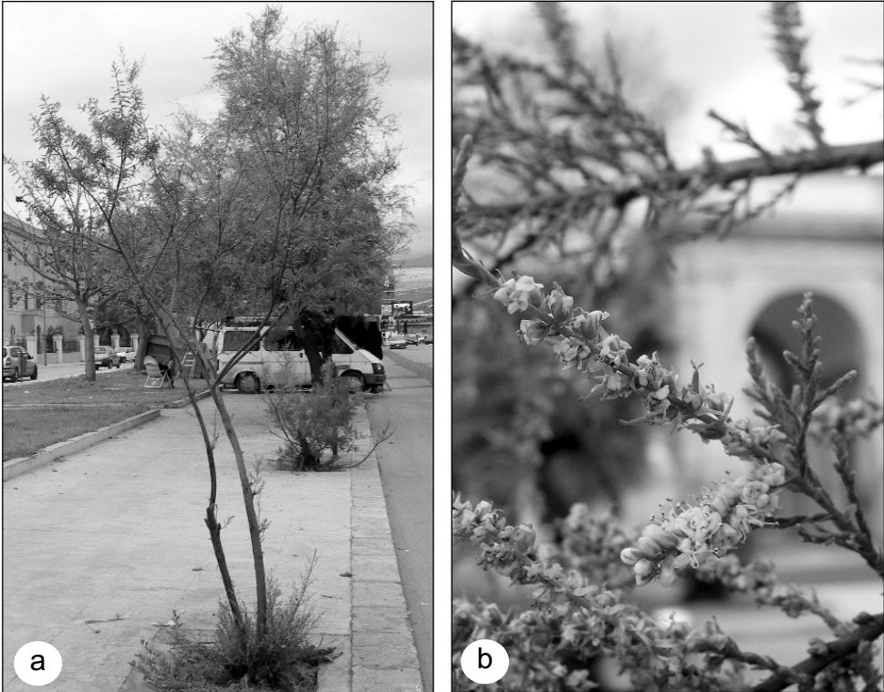
Fig. 9. Tamarix rosea : a ) individuals cultivated as ornamental along the streets of Foro Italico (town of Palermo); b ) the aestival raceme.

Distribution: Palermo, Campofelice di Roccella (province of Palermo), Trabia (province of Palermo).