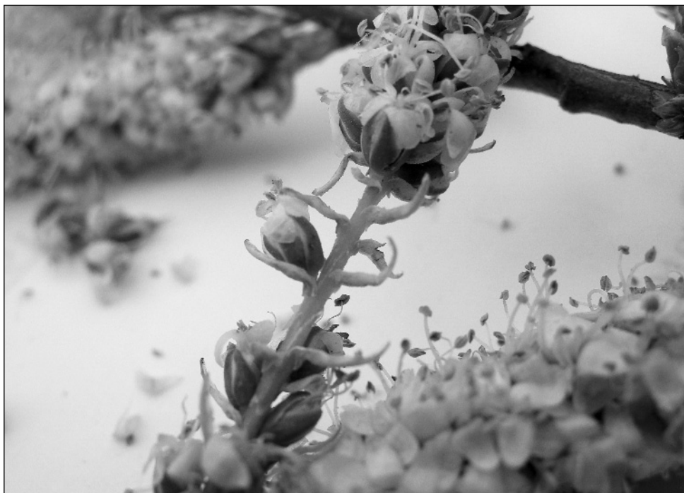
Fig. 7. The bract exceeding the calyx in the vernal raceme of Tamarix africana var. fluminensis .

Palermo), Lascari (province of Palermo), Castelbuono (province of Palermo), Caltabellotta (province of Agrigento), Torre Salsa (province of Agrigento), Eraclea Minoa (province of Agrigento), San Leone (town of Agrigento).