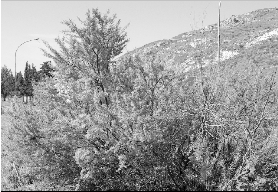
Fig. 11. Tamarix parviflora on the wild along the road from Sciacca to Agrigento.