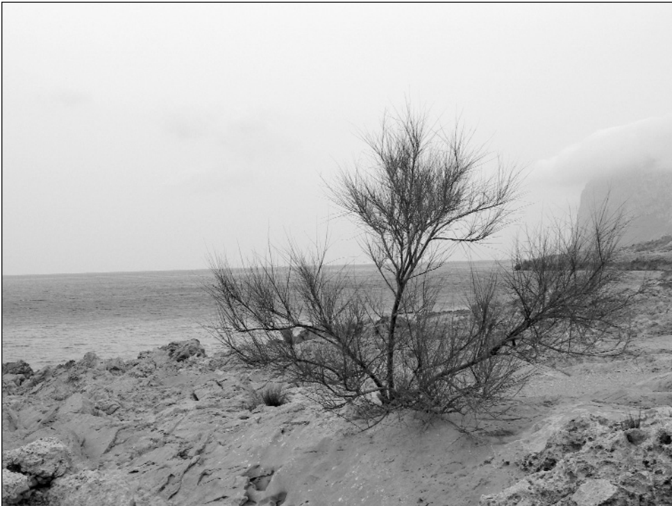
Fig. 4. Tamarix canariensis on cliffs near Isola delle Femmine (Palermo).