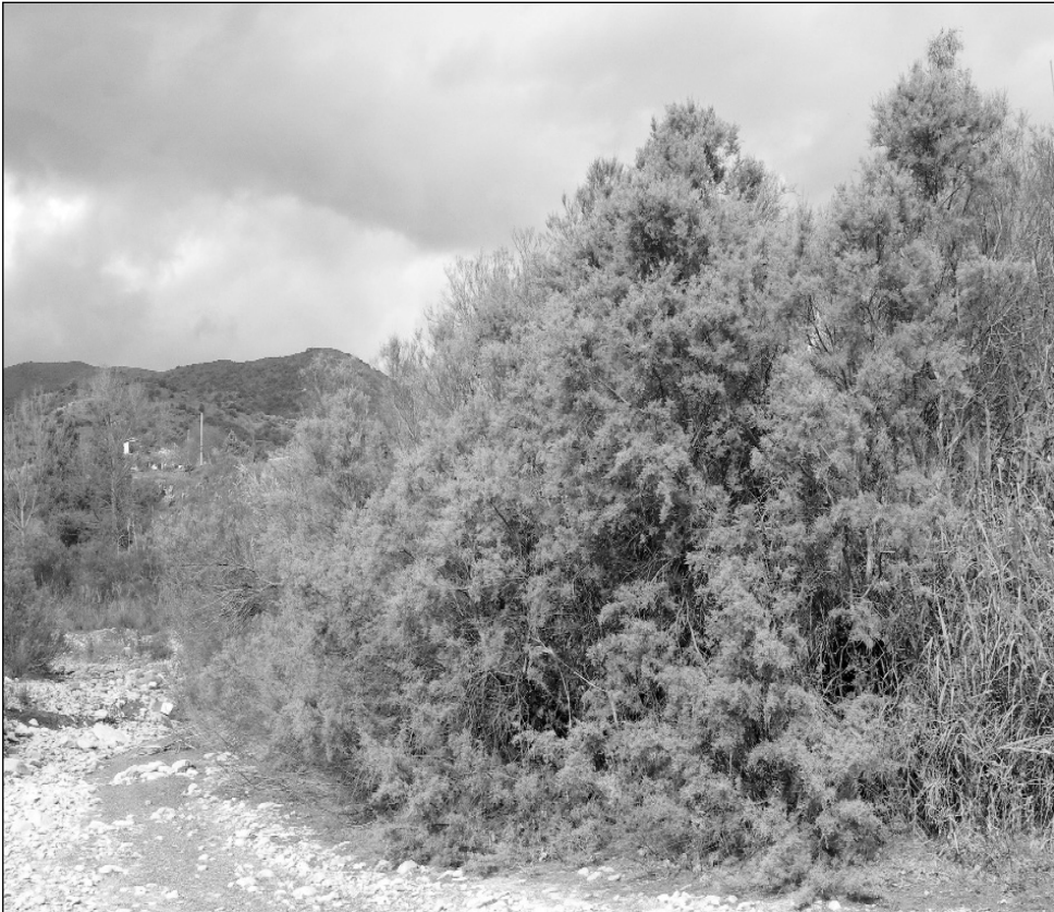
Fig. 8. Tamarix hampeana in the river-bed of Torrente Castelbuono (Palermo).

Notes: Previously recorded as new species from Italy by De Martis et al. (1984). According to Baum (1978) is distributed in Greece, Turkey and Israel. This is the first record from Sicily.