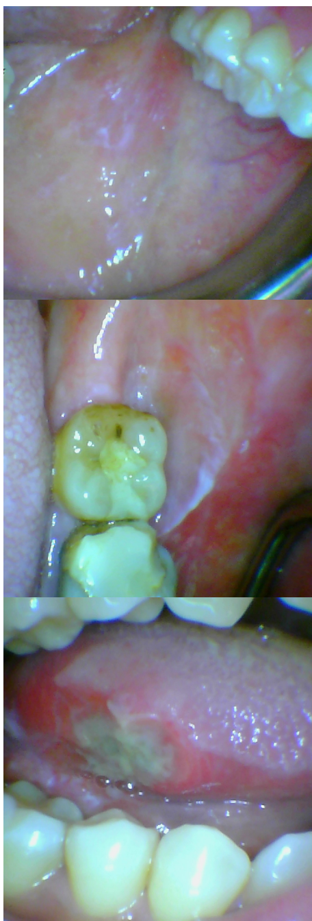
Fig. 4. Images acquired with the IOC HK 790 and transmitted to the OME.

examination like the other data. The system presented in this paper can be modified to be suited to other medical purposes, not just oral medicine. Indeed, many functionalities provided by the system are common to other telemedicine system In this way, in this way the system can be modified with limited efforts to achieve telemedicine systems for other medical specializations. Moreover, the acquisition equipment can be different from the one used in this work, which is directly connected to a USB port, but even though the new video source would be an analog signal, it can be easily converted using a video sampling device, which usually is a