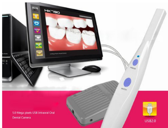
Fig. 1. The intra-oral camera HK 790.

and we have chosen the HK-790 (fig. 1). Such a device was chosen because it offers the best quality/price ratio. It is a 5.0 Megapixel CCD/CMOS device encapsulated in a package suitable to be introduced in the oral cavity, which is connected to the PC via USB 2.0 port, and the maximum resolution available is 2560(H) x 1920(V). It has an anti-fog lens which prevents the formation of condensation and LEDs surrounding the lens for proper illumination of the oral cavity without the need for additional light sources.